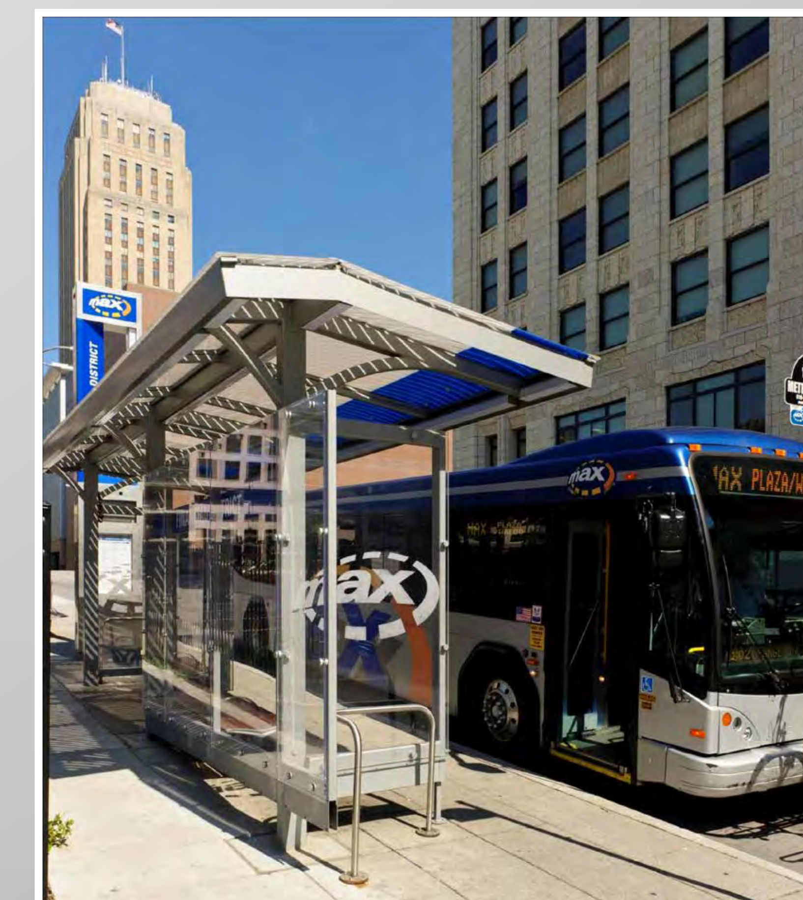
Troost Avenue MAX