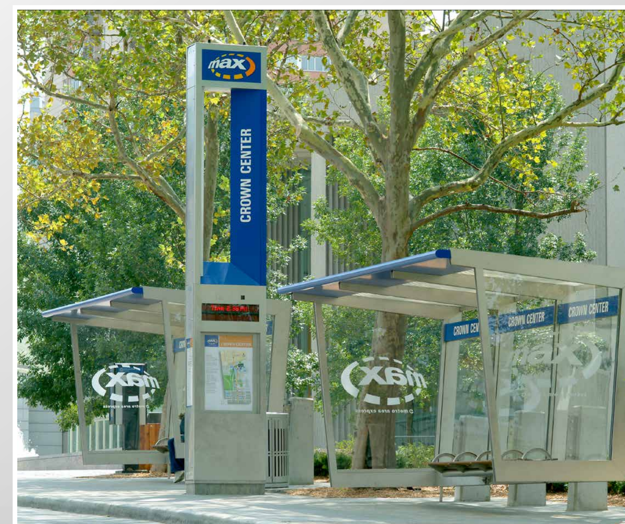
Main Street MAX